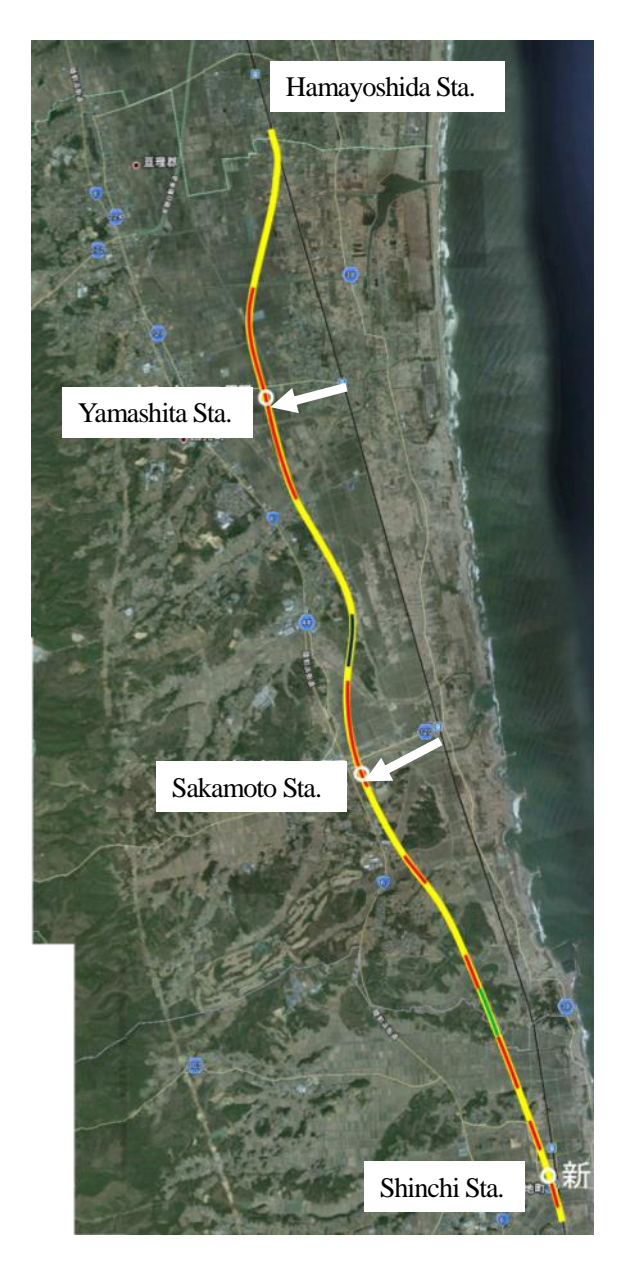
Fig. 4: Relocation of Joban Rail Line

project plan includes the relocation of stations and railway tracks in accordance with the relocation of residential areas. (Fig. 4)